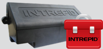
Remote Polling Module II (RPM II)