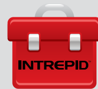
INTREPID™ POE Communications

Southwest Microwave is committed to providing perimeter security solutions that will integrate seamlessly into our customers' overall security programs. We offer Software Development Kit (SDK) documentation to developers and systems integrators for INTREPID™ Series II perimeter intrusion detection systems (MicroPoint™ II, MicroTrack™ II, MicroWave 330) and INTREPID™ POE perimeter intrusion detection systems (Model 316-POE, Model 334-POE-S, Model 336-POE, MicroPoint-POE-S) enabling discovery, monitoring, command and control of these technologies through new or existing Physical Security Information Management (PSIM) or Video Management System (VMS) platforms and other custom control applications.